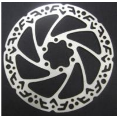
1mm stainless steel