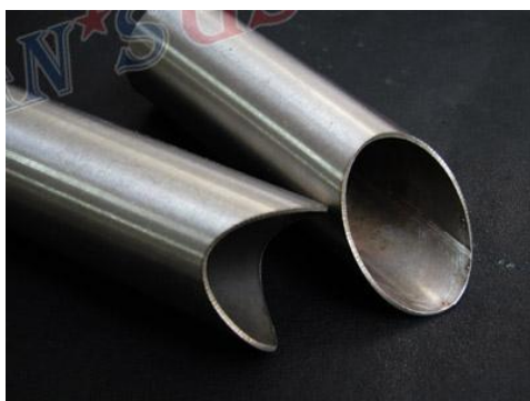
2mm carbon steel tube cutting