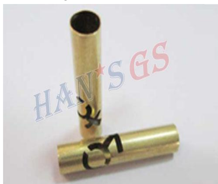
1mm brass tube cutting