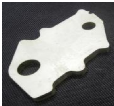
10mm stainless steel