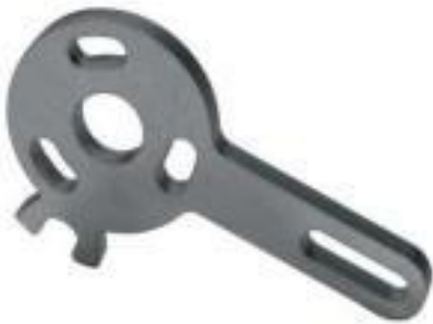
5mm carbon steel