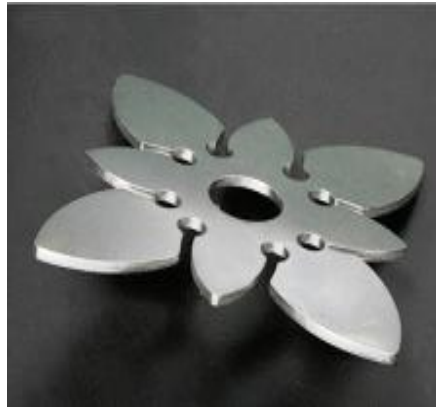
3.5mm stainless steel