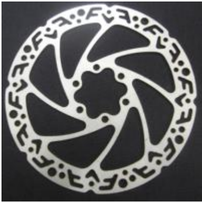
1mm stainless steel